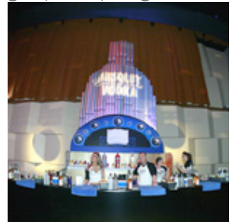
Taking inspiration from the rock opera Tommy , the Absolut-sponsored bar featured an organ with pipes in the shape of an Absolut bottle.