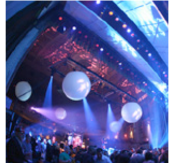
Maxim's Rock City Super Bowl event took over downtown Detroit's Max M. Fisher Music Center, filling it with music, a casino, roller skating girls, and 2,000 guests.